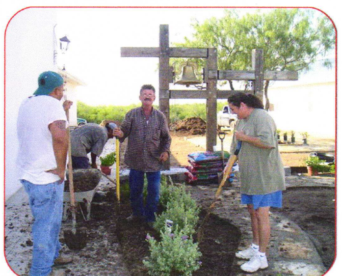
Happy and hard workers