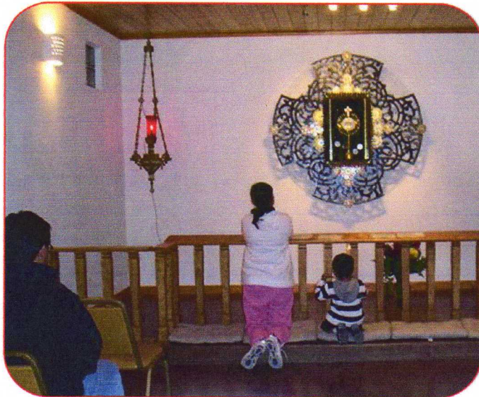
Family at prayer in adoration chapel