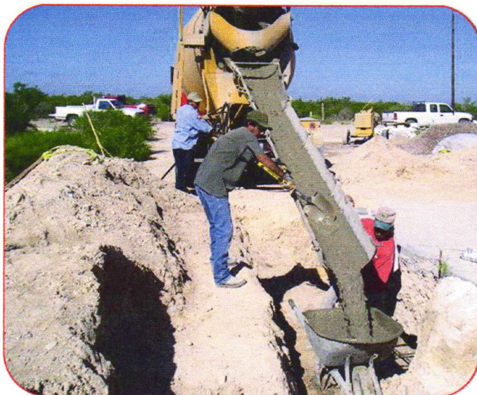
Reinforcement of foundation