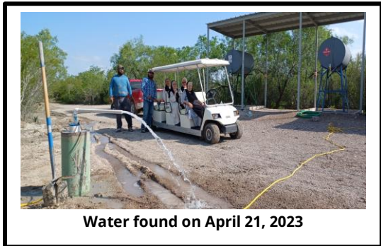
Water found on April 21, 2023

We are most thankful to God and your financial support that allowed us to dig a Water Well and find much needed water. We are blest with a 30-foot natural spring approximately 640 feet below the surface.