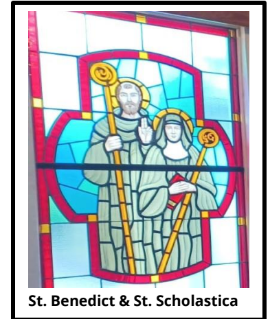
St. Benedict & St. Scholastica

We were blessed with gifts . We have reminders of war, in beautiful religious art pieces, gifted to us from the Ukraine. May we ALL pray the rosary daily to help counteract the hatred in the hearts of people. Another special gift was three beautiful stain glass windows placed in our monastic chapel.